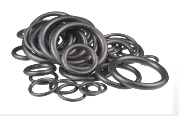
2 O-rings made of elastomer compounds

When analyzing seals or gaskets, a fast dynamic response which is directly related to their dynamic-mechanical material properties is of primary interest. Typically, if "leakage" occurs, restoring forces are not strong enough. Unfortunately, these properties depend on the temperature and, of course, on the applied frequency. DMTA provides a powerful means of analyzing these failure limits by applying dynamic strain sweeps performed under different load conditions like preload, frequency or temperature. Ideally suited for such measurements is the EPLEXOR® 500 N by NETZSCH GABO Instruments (figure 1).