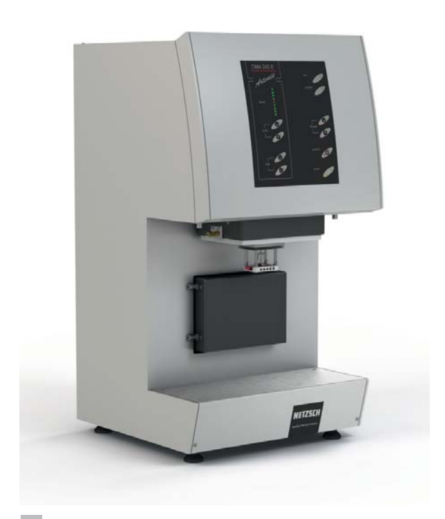
3 The versatile DMA 242 E Artemis