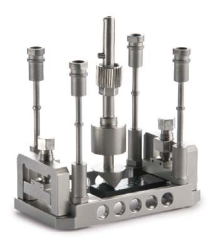
4 Sample holder for bending of composites