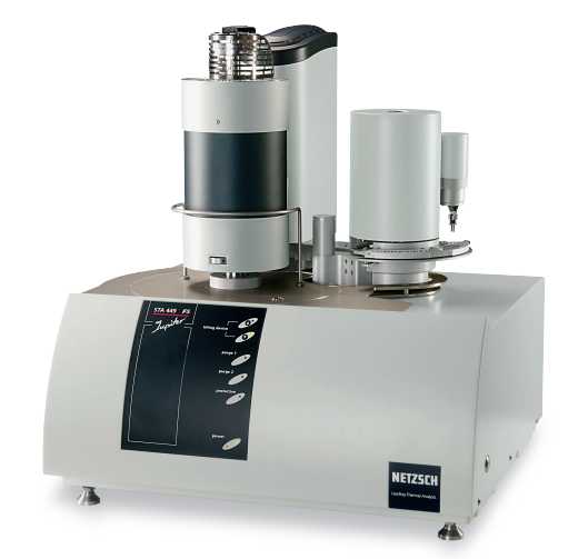
1 STA 449 F5 Jupiter®

The STA measurement was carried out between room temperature and 1450°C. The DSC curve (blue) depicts the melting of a hastelloy sample (alloy 22) at 1358°C (extrapolated onset) with an enthalpy of 165 J/g. During cooling, crystallization occurred at 1351°C (extrapolated endset) with nearly the same enthalpy change (red DSC curve). During heating and cooling, neither a mass loss nor an increase due to oxidation was observed (TGA Signals).