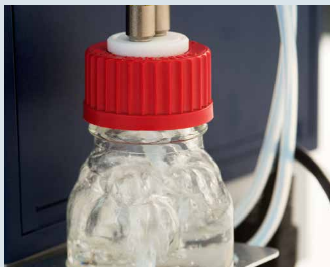
Residues are aspirated and collected in the wash bottle.