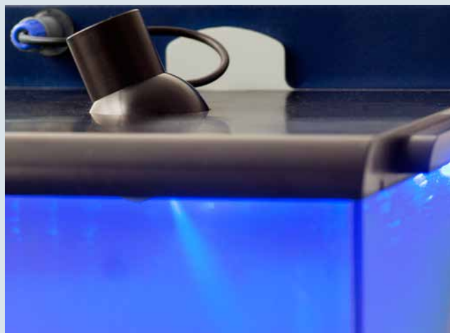
The nozzle generates an extremely fine reagent mist.

Any residue remaining in the gas phase is automatically aspirated by the integrated pump and collected in the wash bottle behind the instrument. After the reagent transfer has been completed, the hood lifts at the push of a button and the TLC/HPTLC plate can be removed for further processing.