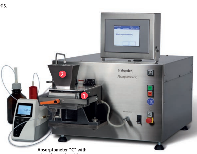
Absorptometer "C" with mixer for testing silica or other free flowing materials