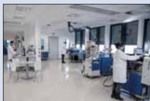
Brabender application laboratory