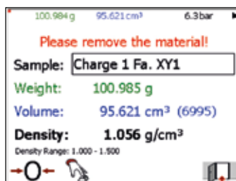
Display of the results of a single test