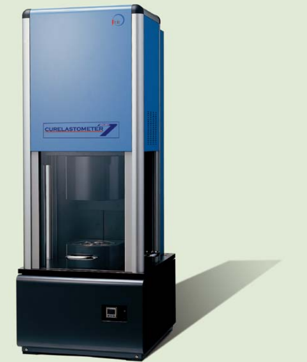
Curelastermeter is a registered trade mark of JSR Co.,Ltd