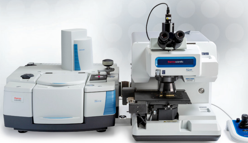
Nicolet iS50 FTIR Spectrometer