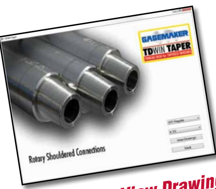
Pick Size & View Drawing