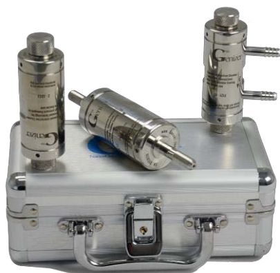
Diamond Interaction Chamber